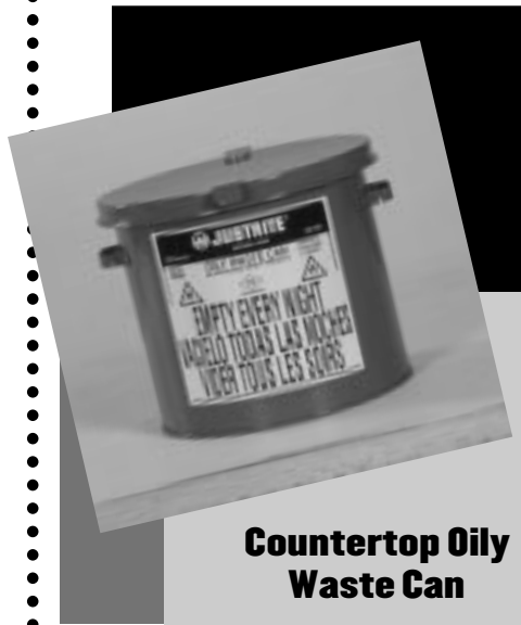
Countertop Oily Waste Can

Any department or facility where rags and cloths can become soaked with flammable liquids are prime opportunities for fire hazards as a result of spontaneous combustion, spark or care-less smoking.