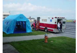
DAT@ 3060 Shelter 11' w x 21' L x 9' H 200 sq. ft, 2 win-