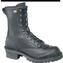
Part #0012 9200