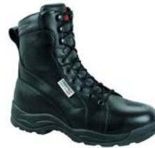
Part #0012 9050 (Men's) Part #0012 9052 (Women's)