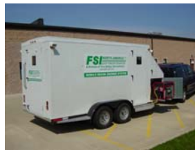
F-THD20-20' Trailer System