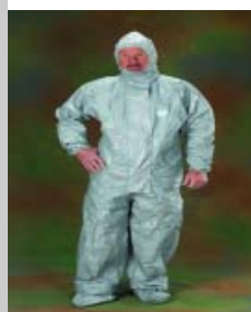
Tychem® F 60151