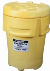
Justrite Part #28201

95-gallon Overpack Salvage Drum is the safe and economical solution to the transportation and temporary storage of damaged or leaking drums of hazardous materials. Rugged, UV-protected polyethylene withstands the rigors of land, air and sea transportation. "X" rating offers the highest UN and D.O.T. certification available. Can be used with all packing classes of hazardous materials, I, II and III including solvents, acids, poisons and explosives.