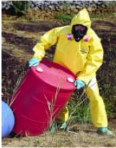
Tychem® BR151 Level B Suit

Chemical Protective Clothing backed by superior permeation data on over 200 nasty chemicals, including the ones involved in most industrial or hazmat incidents, as well as chemical and biological WMD. Excellent tear, puncture and abrasion resistance, plus enhanced comfort make these garments a dream to work in. Also available in Tychem® LV (low visibility military green).