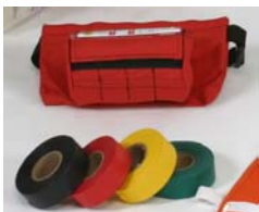
Part # F-EM-19

Green, Yellow, Red, Black Tape with Carry Bag