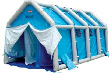
DAT@ 3060S Shower 3 Line 3/4 stage mass casualty decon shower system