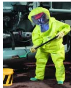
Tychem TK® 650 Level A