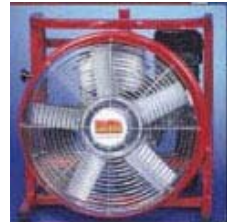
Fantraxx 18" Low Profile Positive