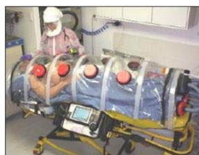
Part #: F-INPIC-2

Provides safe transportation of victims of radiological, biological or chemical incidents to more advanced medical treatment. Creates a negative airflow when connected to the HEPA Air Filter system, it eliminates cross-contamination and protects health care providers. with PAPR with rechargeable battery and charger, creates flow when connected to optional HEPA air filter system. Comes with 4" re-sealable red colored access ports to allow passage of O2 or Intravenous tubes from outside to patient.