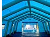
DAT@ 6012 (Interior) Shelter 20' W x 40' L x 10" H, 6 windows, 3 skylights