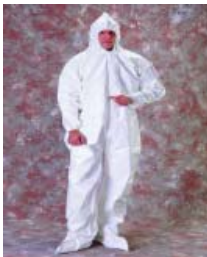
Tychem® SL 72150